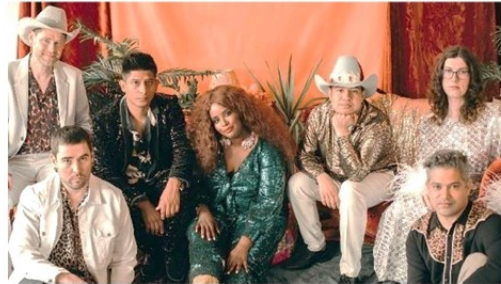
THE SUFFERS GULF COAST SOUL SATURDAY, MARCH 4, 2023