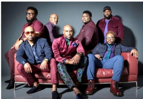
NATURALLY 7 A CAPPELLA "VOCAL PLAY" ENSEMBLE SATURDAY, JANUARY 28, 2023