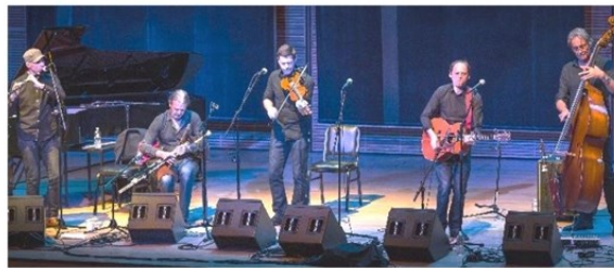
LÚNASA TRADITIONAL IRISH MUSIC SATURDAY, MARCH 25, 2023