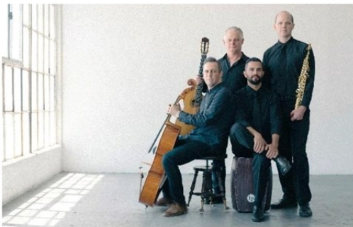
QUARTETO NUEVO WORLD JAZZ FUSION ENSEMBLE SATURDAY, NOVEMBER 19, 2022